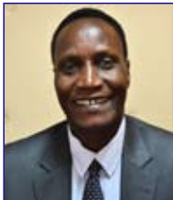
Prof Jacob Kaimenyi Cabinet Secretary MoEST, Kenya