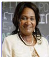
Hon. Dr Itah Kandjii - Murangi Minister of Higher Education, Training and Innovation