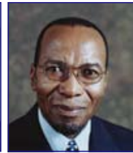
Hon. Mosibudi Mangena Minister of Science and Technology, South Africa