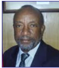
Hon. Nangolo Mbumba Minister of Education Republic of Namibia