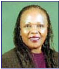
Dr. Libertina Amathila Deputy Prime Minister Republic of Namibia