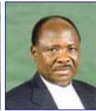
Hon. Joel Kaapanda Minister of ICT Republic of Namibia