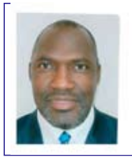
Hon. Tjekero Tweya Minister of Information and Communication Technology