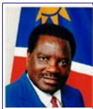
H.E. Dr Nickey Iyambo Vice President, Republic of Namibia