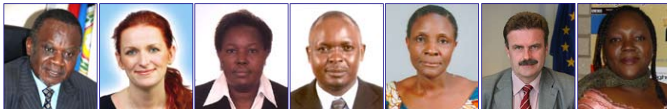
Hon. Aggrey Awori Minister of ICT, Uganda